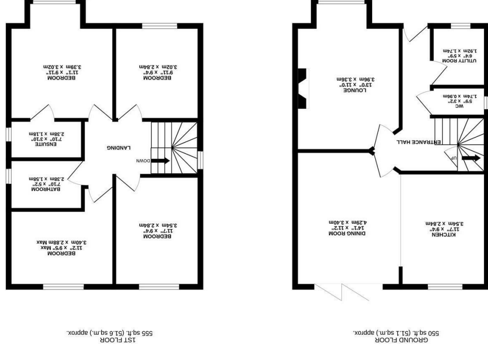
GROUND FLOOR 550 sq.ft. (51.1 sq.m.) approx.